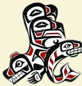
RAVE Drop-In Logo

Through a combination of Traditional Ecological Knowledge (TEK) and western science, participants will learn practical skills to increase the adaptive capacity of their home communities